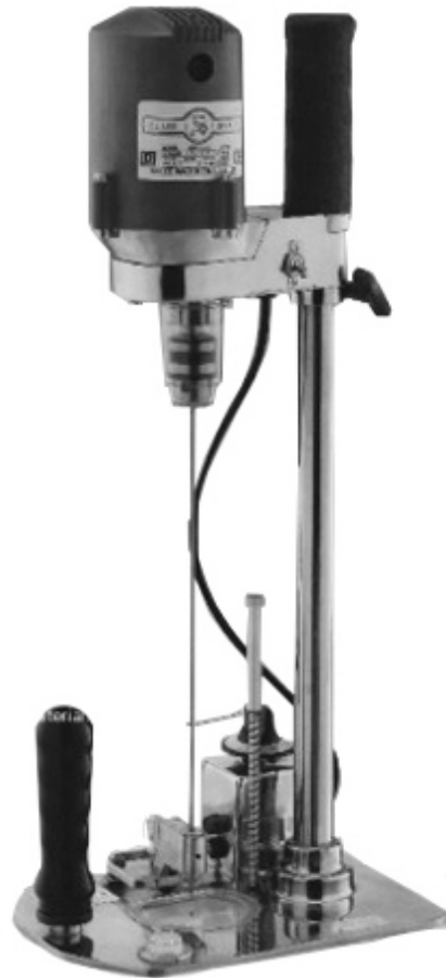
PCD 600 POWERTEMP DRILL 電熱鑽布機