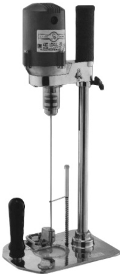
CD 600 CLOTH DRILL 鑽布機